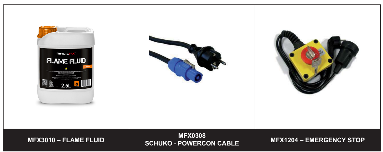
Figure 9: Accessories Flamaniac

The items listed can be ordered from your MAGICFX® distributor. Locate a distributor near to you by contacting;